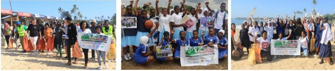
Participants in different actions during clean-up activities at Coco Beach