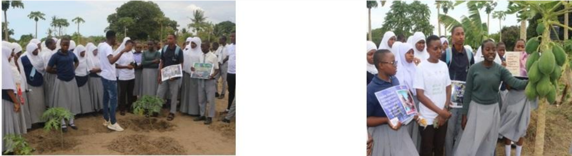
School farm visiting for participants and learn on how students managing that farm on environment conservation