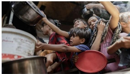
Only a handful of aid trucks have begun to enter Gaza, where airstrikes continue.